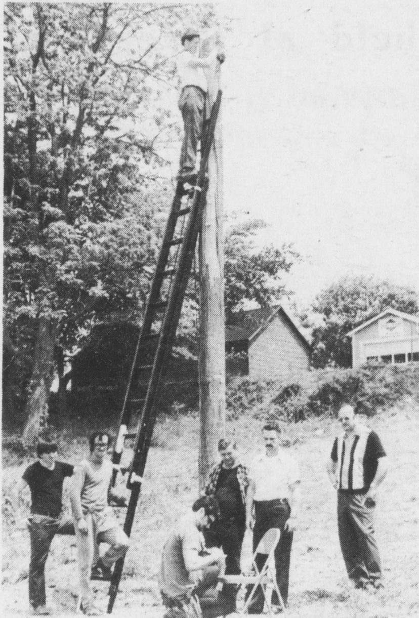
Photo shows some of the men of the Pioneer Fire Company stringing lights for the company's carnival this Saturday.