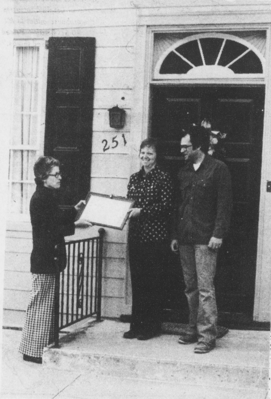
The Showalter home