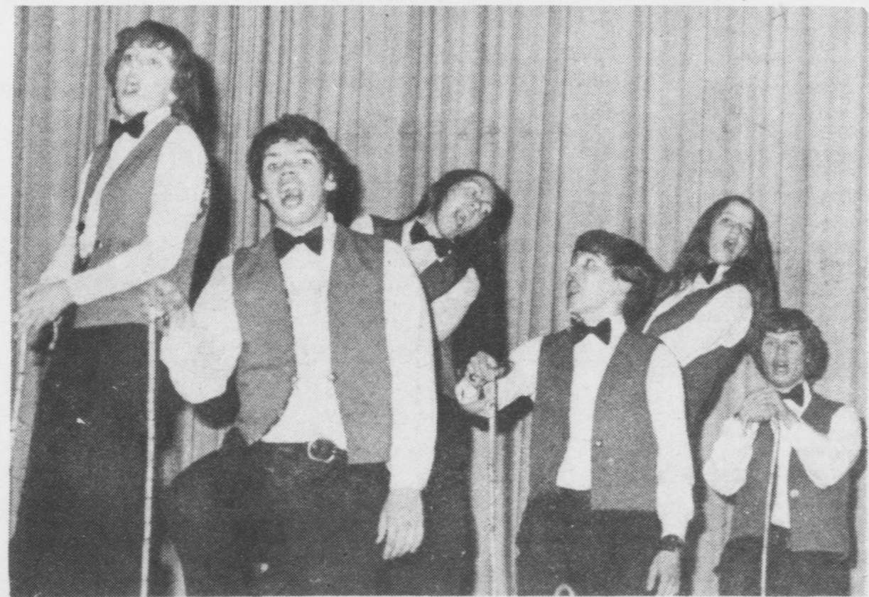
The photo above show the Rhythm Singers as they performed in the Spring Concert held last Saturday at Donegal High School.