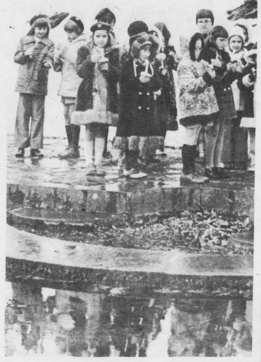
Girl Scouts hold lighted candles at Donegal Springs.