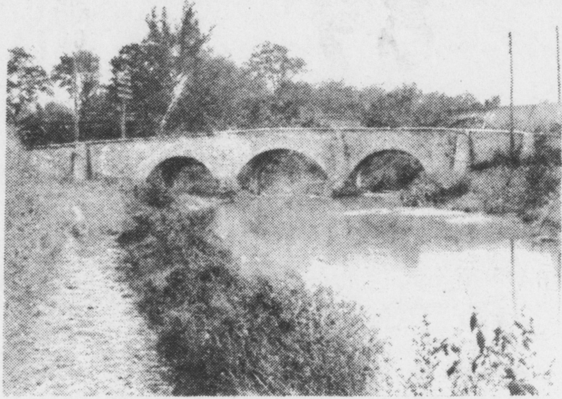
The Pike Bridge, Mt. Joy, Pa.