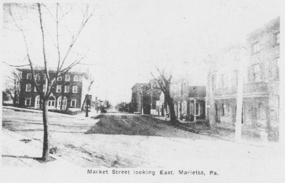
Market Street looking East, Marietta, Pa.