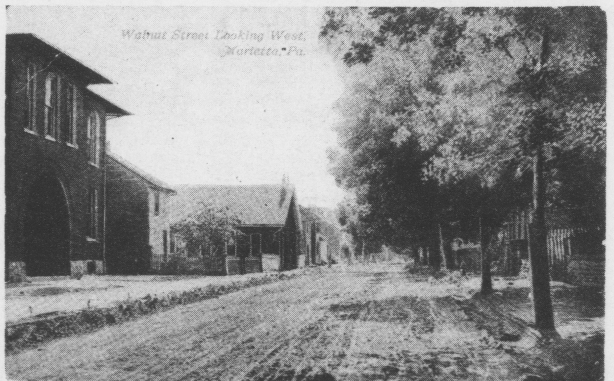
Walnut Street Looking West, Marietta, Pa.