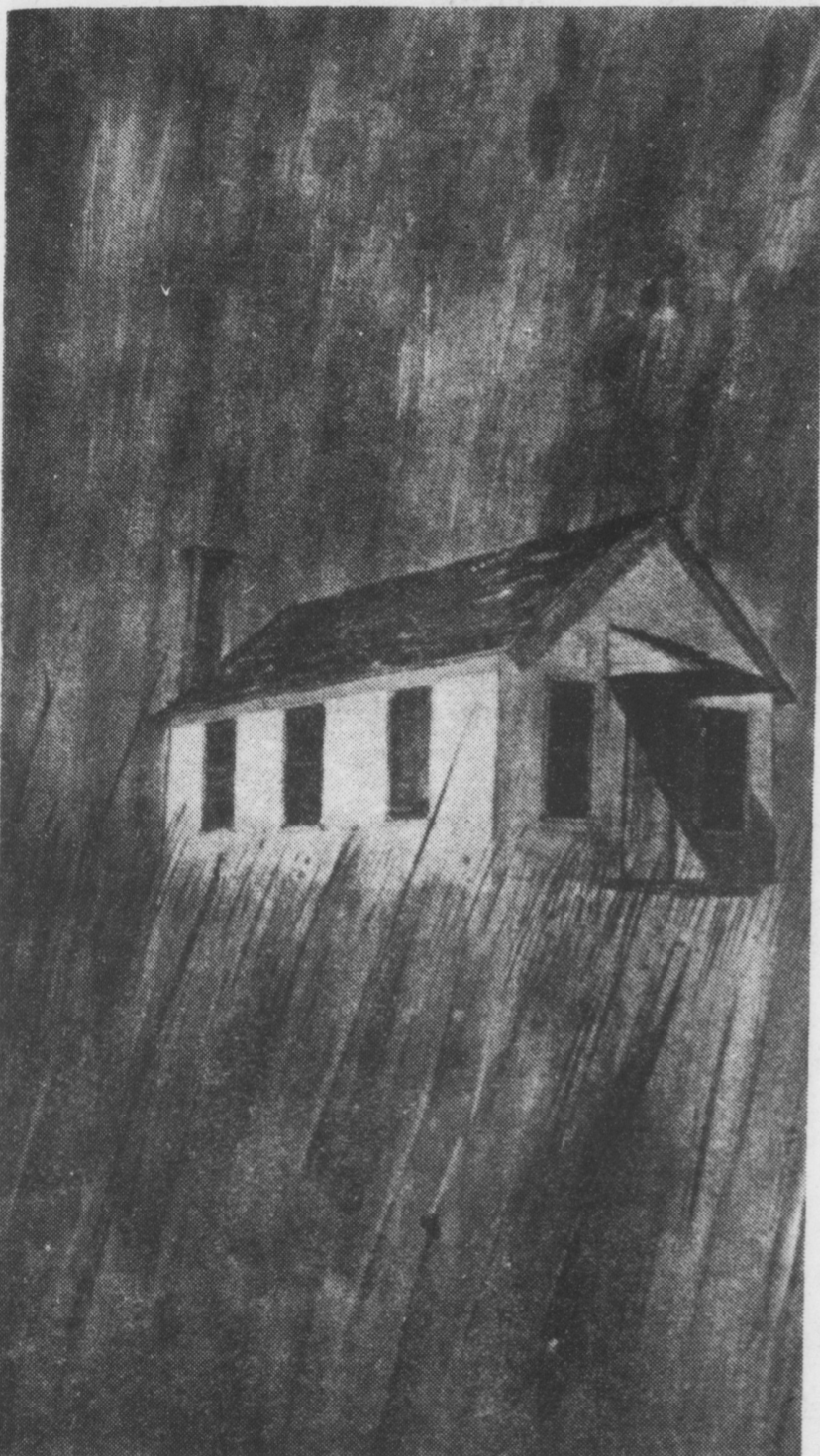
Painting by Warren Foley.