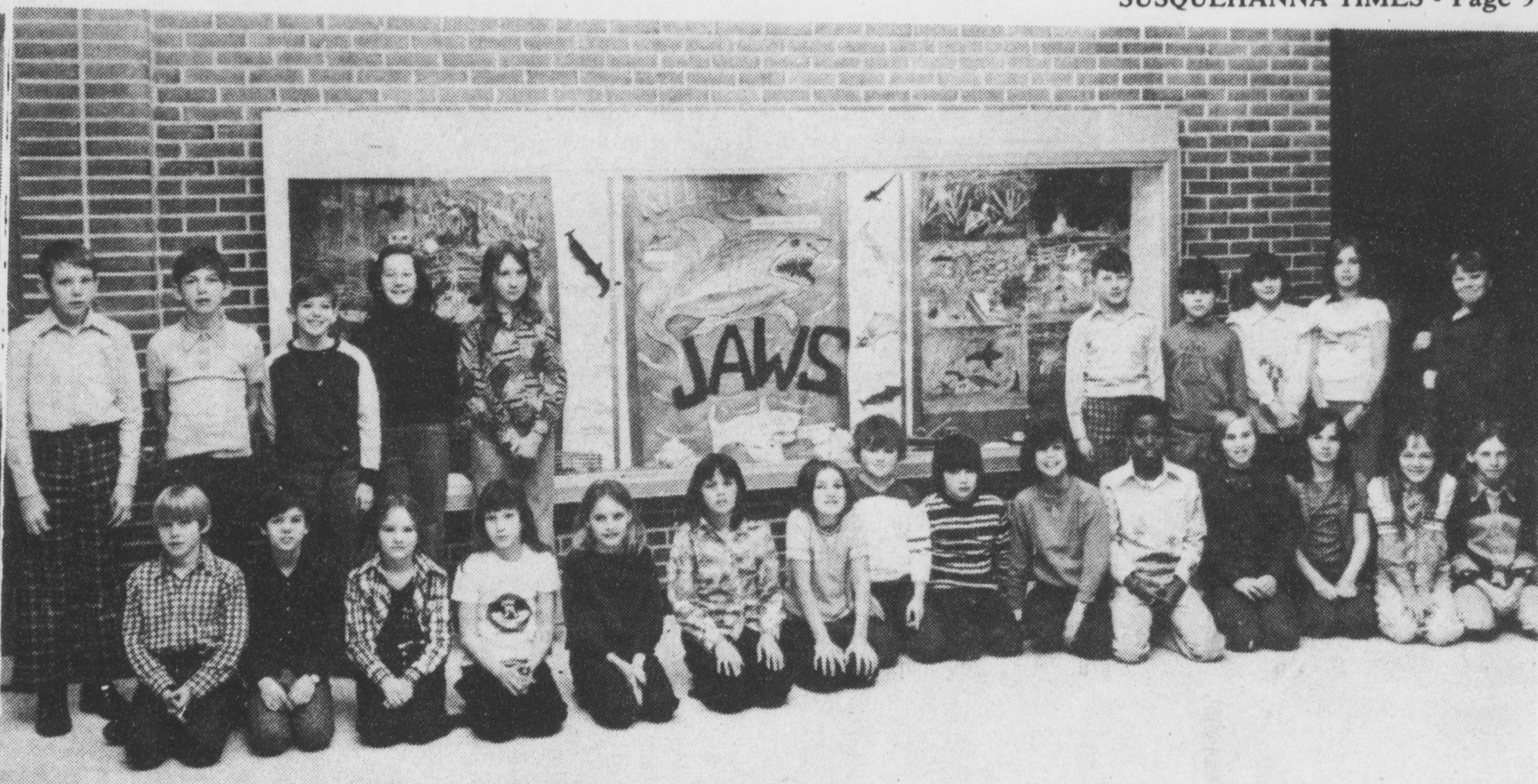
It doesn't have anything to do with Valentine's Day, Washington's Birthday, or Lincoln's Birthday, but it certainly is a nice display.