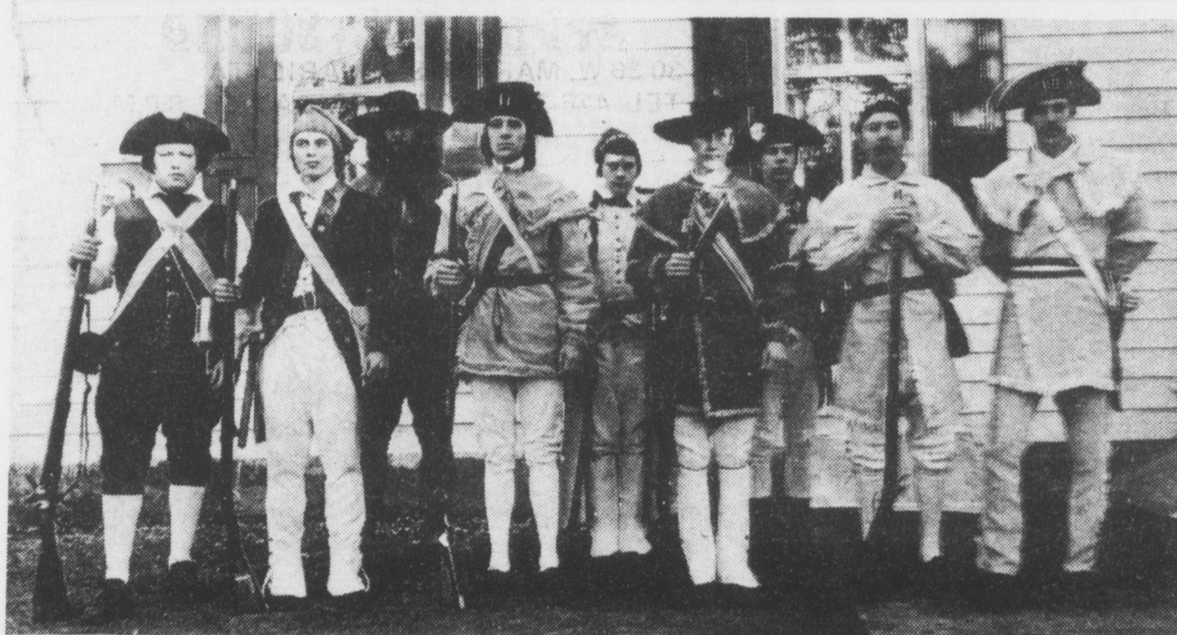
In spite of the recent defeat in Canada, new recruits continue to join the Donegal Rangers. The company mustered in Marietta last week, and some new faces were visible in the ranks. If enough dedicated men sign up, the rebellion against Britain just might be successful.