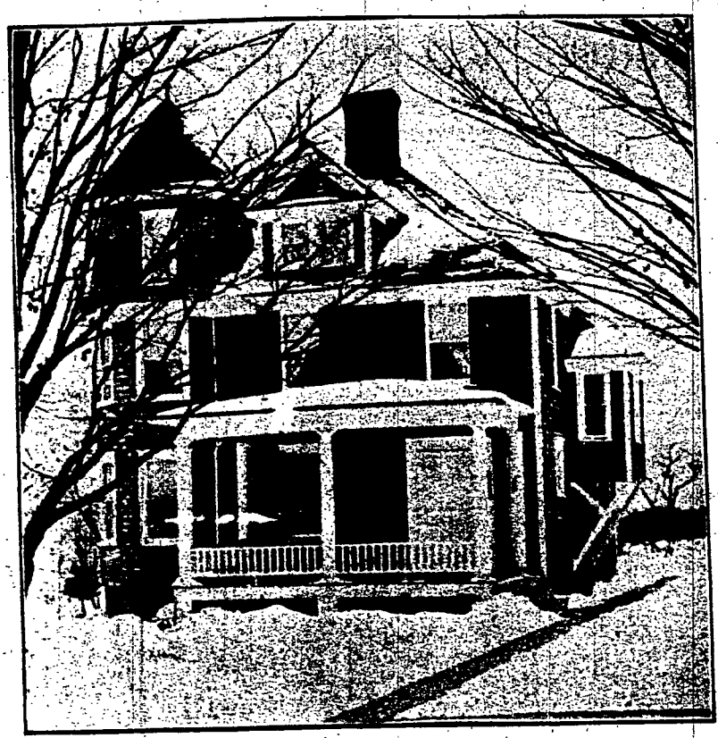
RESIDENCE OF MISS GROENBECK, LOCUST STREET.