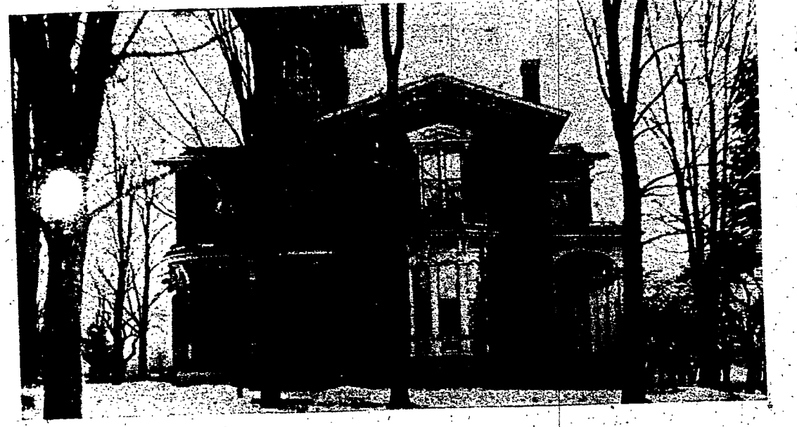
RESIDENCE OF DR. R. A. TORREY, LAKE AVENUE.