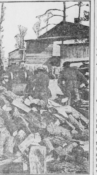
Municipal Woodyard in Operation.

It is a matter of common knowledge that in many localities where wood is abundantly available, almost at the very doors of the farmers, that coal has been hauled from five to ten miles