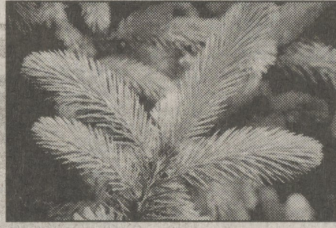
Colorado Blue Spruce