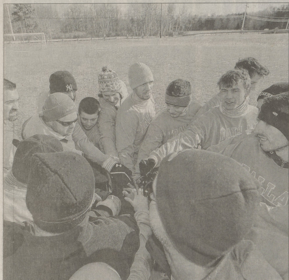
The Dallas High School soccer alumni huddle up before the start of the annual alumni soccer game at 1st Lt. Michael Cleary Field.

The Annual Dallas High School Alumni Soccer Game was played on Nov. 30 at the Lt. Michael Cleary Field on the Dallas School campus.