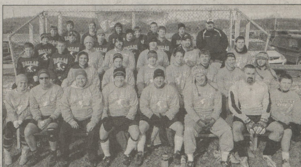
Current and former Dallas High School soccer players pose for a photo at halftime of the annual alumni soccer game at 1st Lt. Michael Cleary Field.