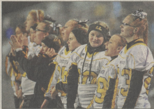
Lake-Lehman cheerleaders root for the black Knights during Friday's PIAA Class 2A playoff game at Spartan Stadium in Kingston.

a power game that had seen the Black Knights run the ball more than 10 times for every pass. Even with the lead, Catasauqua never strayed from its fast-paced, no-huddle attack that had seen the team average more than 20 passes per game over the second half of the season.