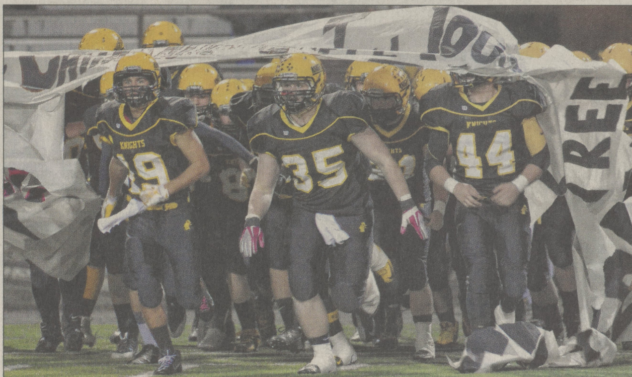
The Lake Lehman football team takes the field at Spartan Stadium in Kingston to play Catasauqua in a PIAA Class 2A playoff game.