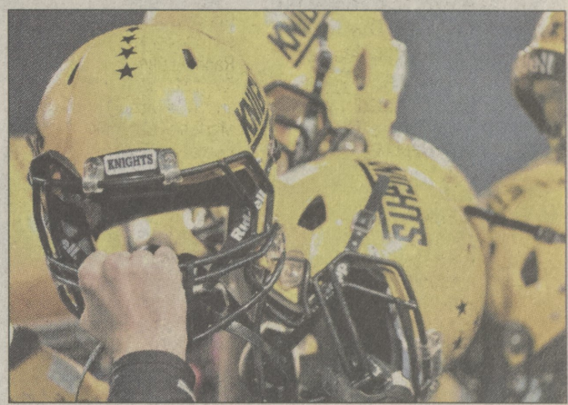
The Lake-Lehman Knights huddle together and raise their helmets before the start of Friday's PIAA Class 2A playoff game against Catasauqua at Spartan Stadium in Kingston.

While those seniors led the Black Knights to a breakthrough season, having the majority of the roster returning also gives reason for hope of more success in the future.