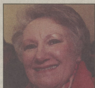
"I WAS IN MUSIC CLASS AT GAR. I WAS 15."