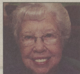
"HOME. SOMEONE CALLED AND TOLD ME TO TURN ON THE TV. I WAS HEART-BROKEN."