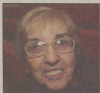
"I WAS 15 IN MUSIC CLASS AT COUGHLIN HIGH SCHOOL AND THEY DISMISSED US."