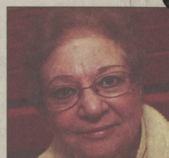
"ST. HEDWIG'S IN KINGSTON. EVERYONE WAS UPSET AND WE PRAYED IN THE HALLS AND CRIED."