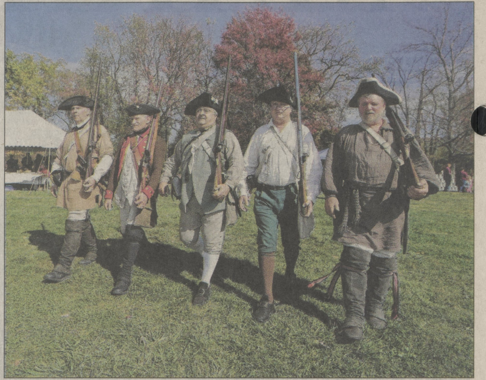
Members of the 24th Connecticut Militia march in formation at Frances Slocum State Park Heritage Day.