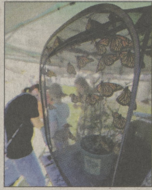
Visitors learn about monarch butterflies at the Folk's Butterfly Farm display at Heritage Day.

Heritage Day at Frances Slocum State Park took participants back in time with old-time demonstrations, music, live animals and crafts.