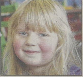
"I'D PUT IT IN THE OVEN, TAKE THE STUFFING OUT AND THEN PUTIT BACK IN."