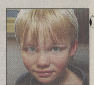
"I'D PUT STUFFING INSIDE THE TURKEY; I'M NOT AFRAID TO PUT MY HANDS IN IT: