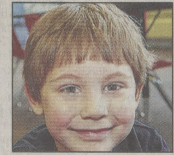
"I DON'T KNOW, BUT MY MOM CHOPS THE TURKEY'S HEAD OFF AND THEN WE EAT THE BODY."