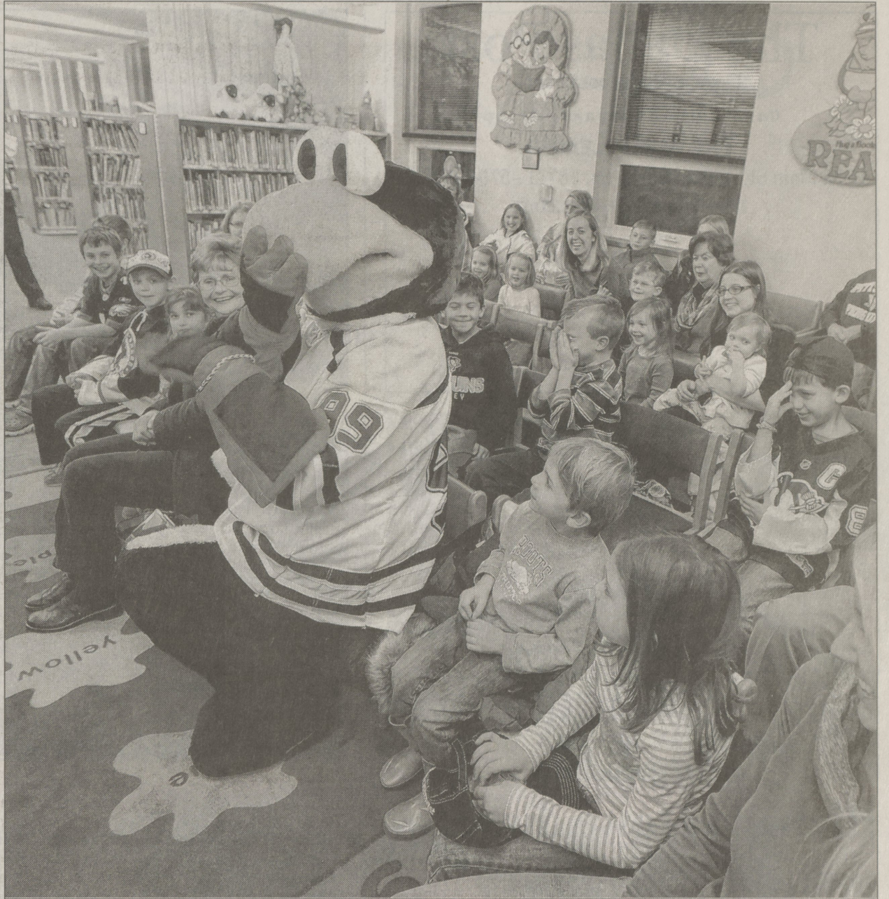
Above, Tux has fun with the children at the Back Mountain Memorial Library.