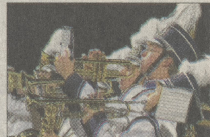
The Dallas High School Marching Band entertains at half-time of the Old Shoe Game game.