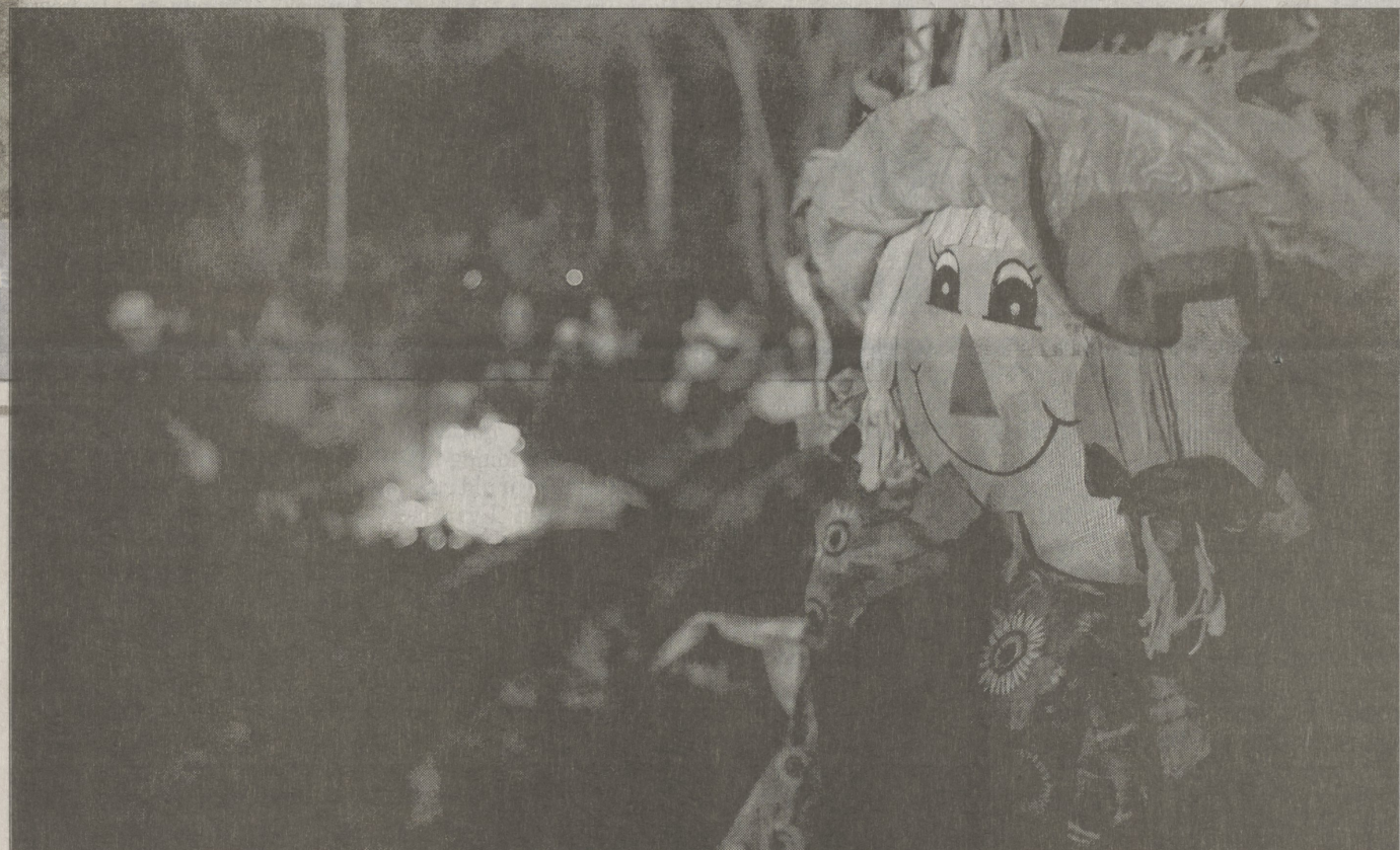
A scarecrow watches guests at the Fellowship Church Fall Festival as they eat s'mores around a campfire.