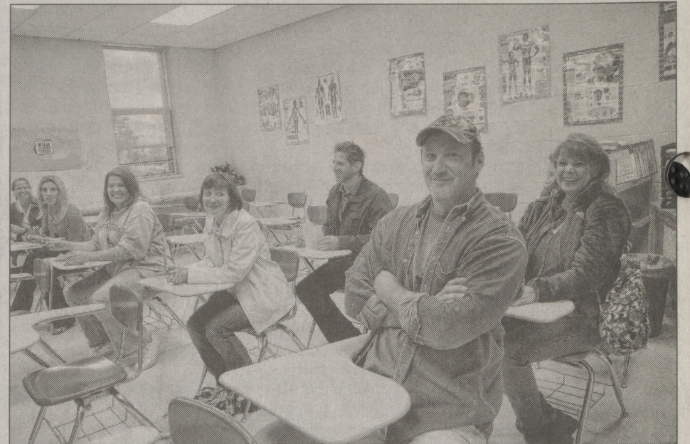
Parents fill classrooms at Lake-Lehman Senior High School for the annual Open House at the school.

Students and their parents converged on the Lake-Lehman Junior/Senior High School for an Open House on Sept. 16. Parents got to see their students' classrooms and students had the opportunity to show off their work to their parents and family members.