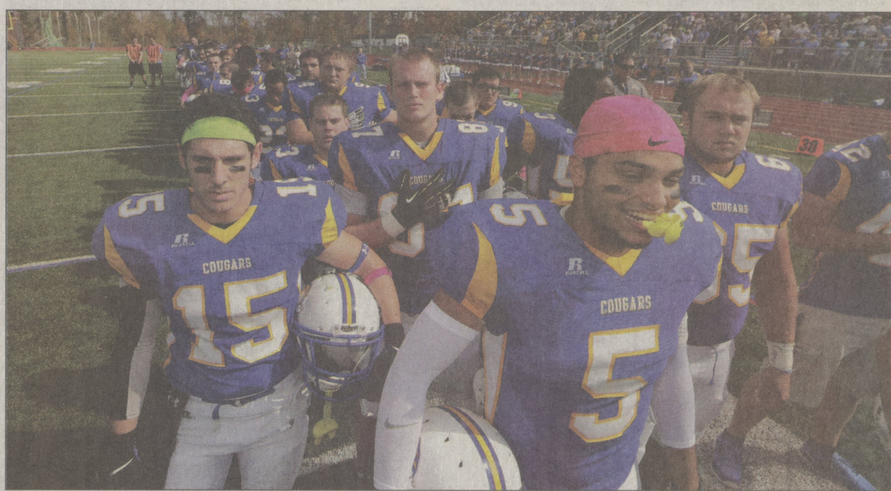
The Misericordia Cougars football team stands for the national anthem before the Homecoming game against King's College.