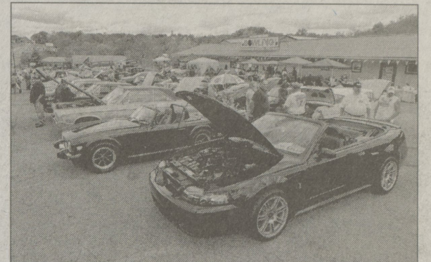
Car enthusiasts look over vehicles on display at the Dallas Knights of Columbus Council 8224 car show at Back Mountain Bowl in Dallas.