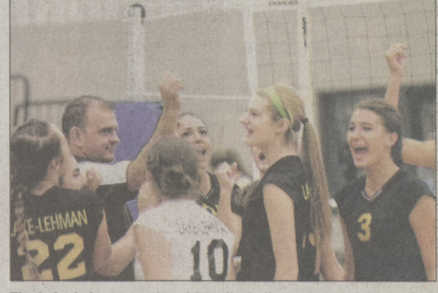
The Lake-Lehman varsity girls volleyball members celebrate their win over the Dallas Mountaineers.