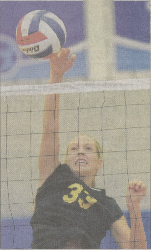
first point of the game against the Dallas Mountaineers.