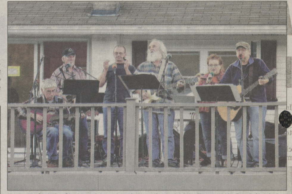
Huntsville Christian Church parishoners perform on the deck at the Harveys Lake Beach Club before the release of lanterns for the 'Lanterns of Hope' benefit.