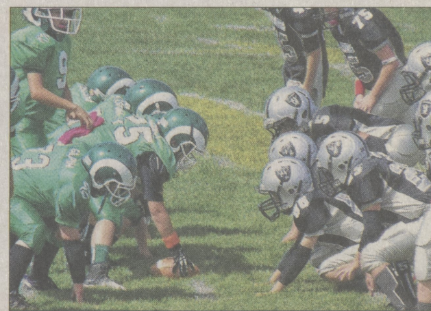
ABOVE: The Kingston Twp. Raiders B team defensive line was stellar against the West Pittston Rams.

Swoyersville added one more score in the waning seconds of the game to make the final, 30-12, in favor of Dallas.