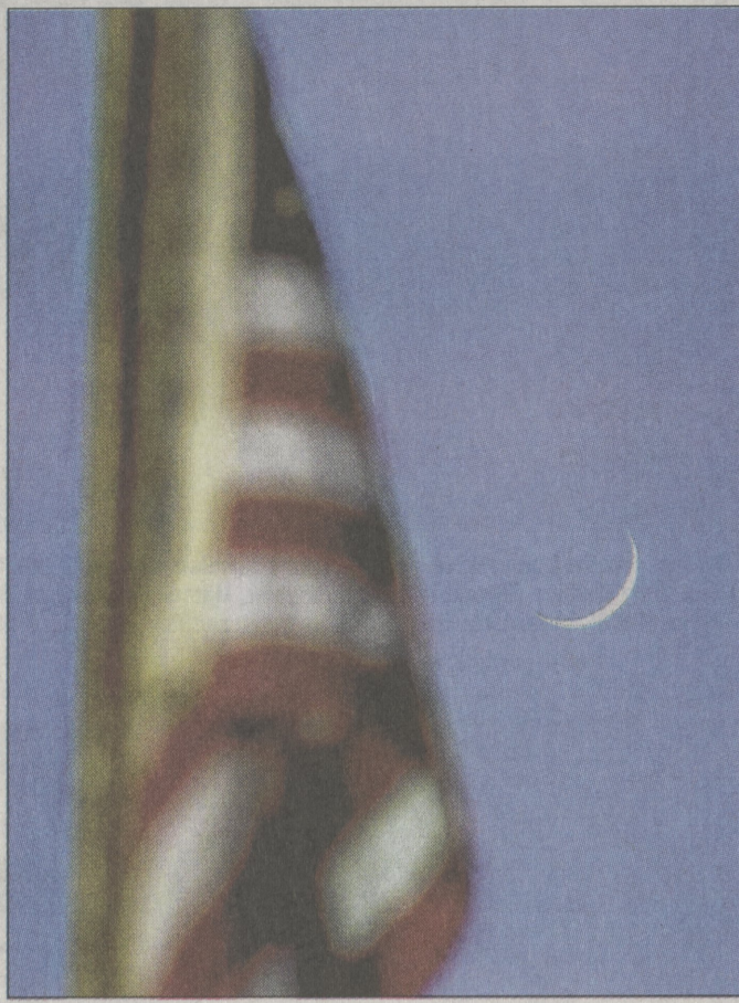
Dallas Post photographer Bill Tarutis took this photo of a waxing crescent moon that appears to sit next to the flag over the Back Mountain Little League field.

"YOUR SPACE" is reserved specifically for Dallas Post readers who have something they'd like to share with fellow readers. Submitted items may include photographs or short stories and should be sent via e-mail to news@mydallaspost.com, by fax to 675-3650 or by mail to The Dallas Post, 15 N. Main St., Wilkes-Barre, PA 18711.