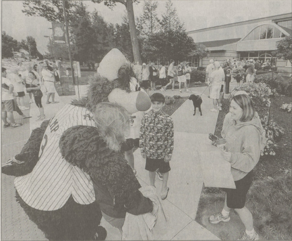
Scranton/Wilkes-Barre RailRiders mascot Champ mingles with runners and supporters at the Anderson Sports-Health Center at Misericordia University before the start of the Fifth Annual Pauly Friedman 5K Run/Walk.

Each person participating in the event raised a minimum of $25 in donations to receive awards. Teams consisted of both walkers and runners.