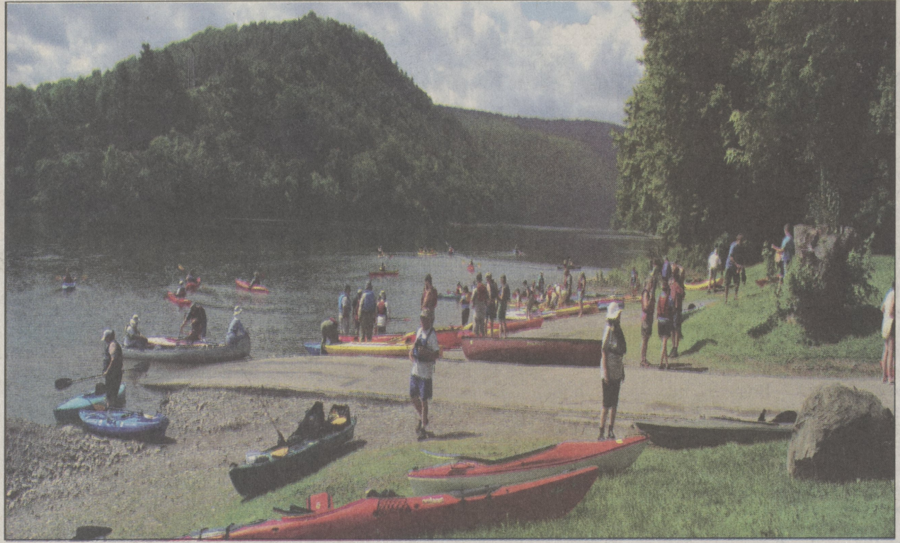
North Branch Land Trust's 13th Annual River Trip is later this month.