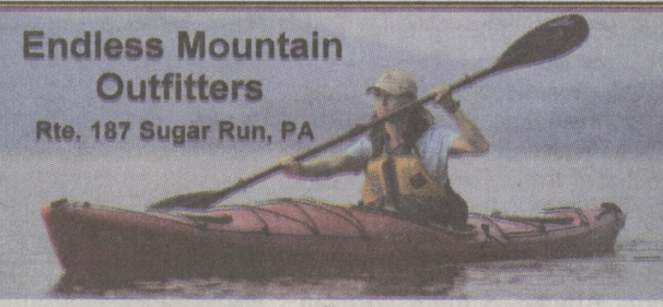
Paddle trips every day on the Susquehanna River