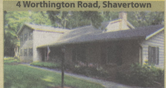
Situated on a gorgeous wooded lot in the desirable Woodridge I subdivision, this spacious 4 bedroom, 5 bath home offers hardwood floors, beautiful custom built-ins. 2 fireplaces, first fl laundry and large closets. Shed and lovely deck. MLS # 13-2876 New Price $347,000

1755 MEMORIAL HIGHWAY, SHAVERTOWN, PA 18708