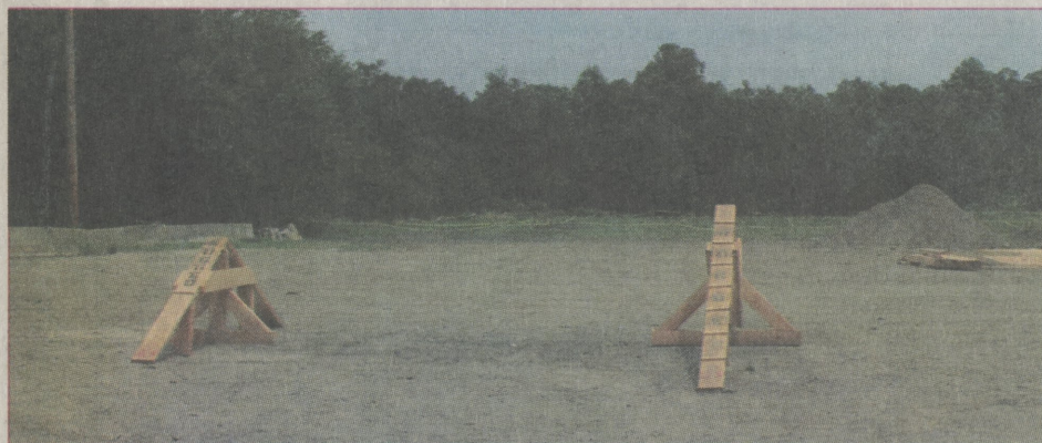
A trio of balance beams called 'Walk the Line' is offered for Rugged, left, Refined, right, and Rogue, center, runners at Saturday's R3Ops Mud Run.