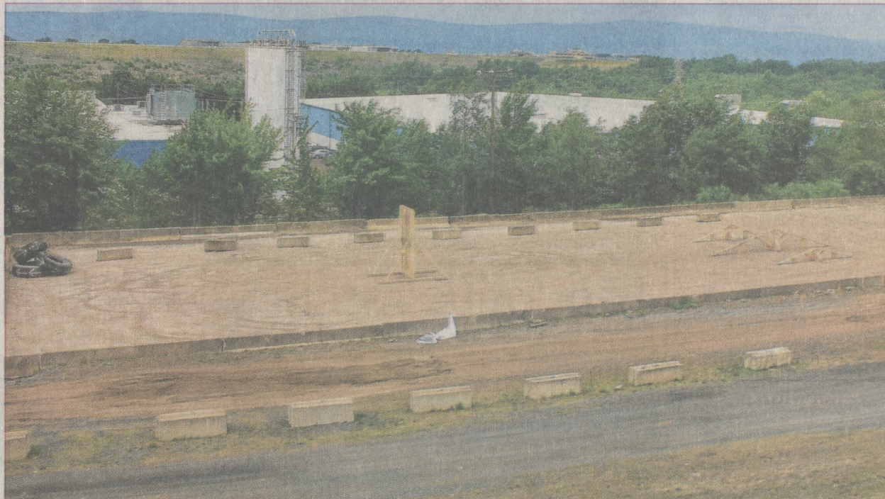
An overview of the extreme area at Saturday's R3Ops Mud Run.