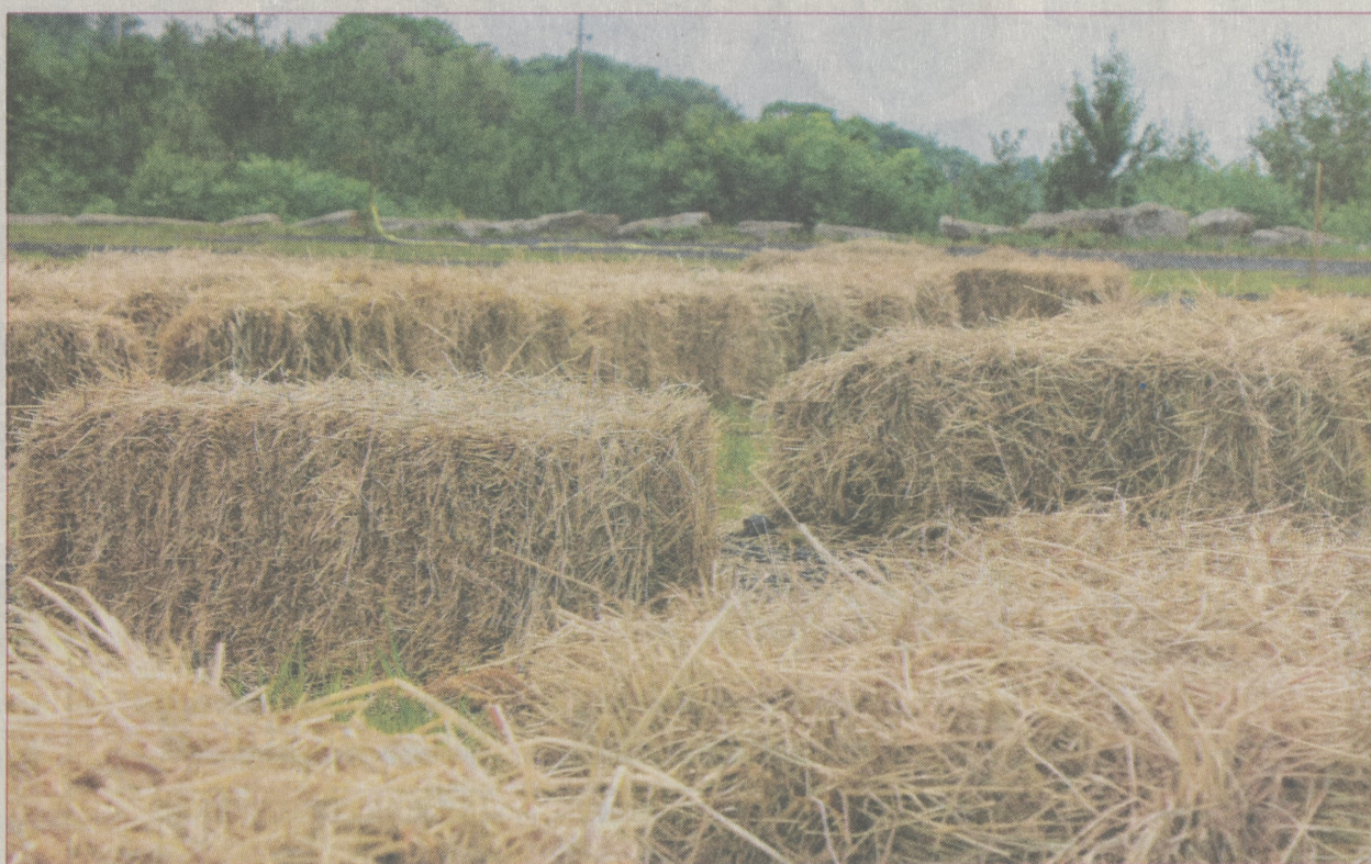
These hay bales will be used for an obstacle called "Ho Hey!" which is a maze at Saturday's R3Ops Mud Run.