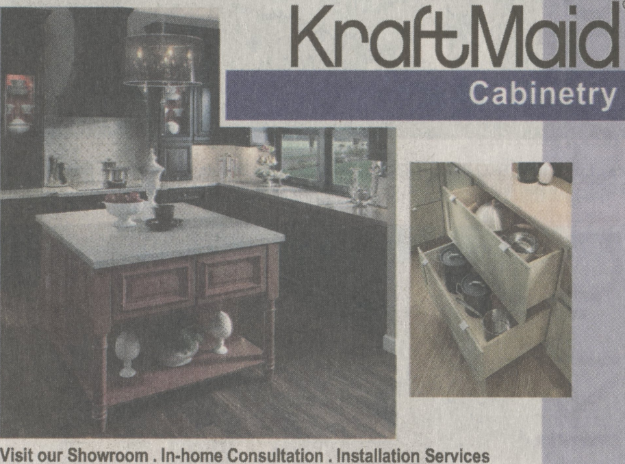
Visit our Showroom . In-home Consultation . Installation Services

2011 JD Power Award Winner: "Highest in Customer Satisfaction with Cabinets"