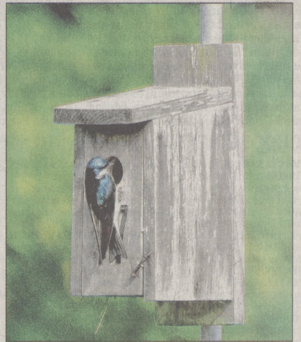
An American tree swallow finds a bird house at Frances Slocum State Park.