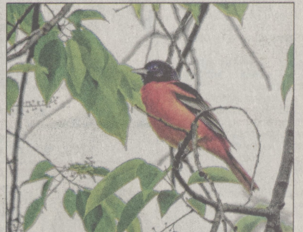
A Baltimore Oriole sits on a branch among the leaves at Frances Slocum State Park.