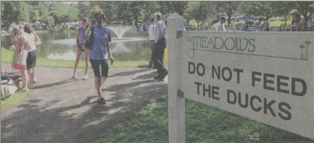
Shoppers take advantage of the Saturday morning sunshine at the Market on the Pond.