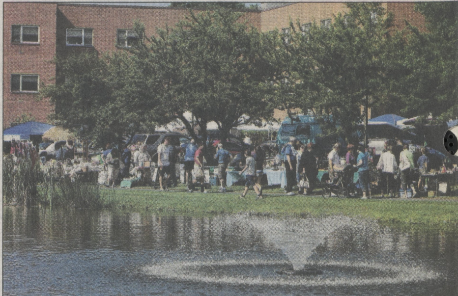
Hundreds of shoppers peruse the items for sale at the Market on the Pond at the Meadows Nursing Center in Dallas.

There were bargains galore - and a great opportunity to support a good cause - at the annual Market on the Pond at the Meadows Nursing & Rehabilitation Center in Dallas.