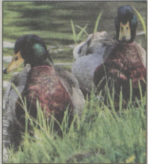
Two mallard ducks make their way around the pond at the Meadows Nursing Center in Dallas during the Market on the Pond.