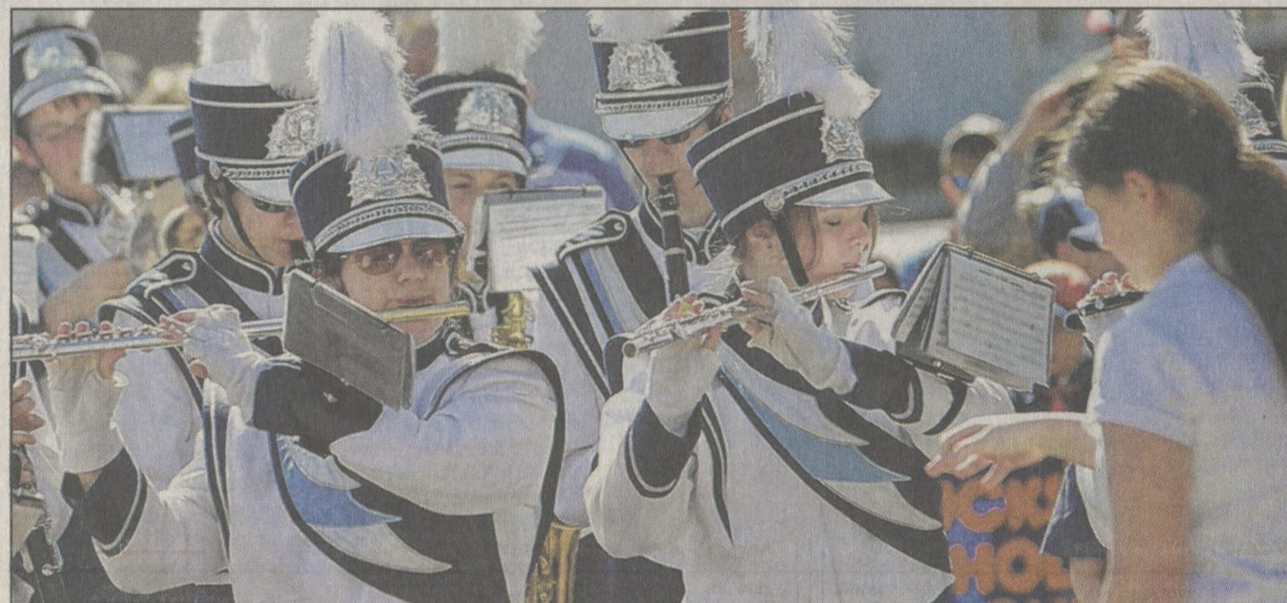
BELOW: Members of the Dallas Senior High School Marching Band take part in Memorial Day ceremonies.