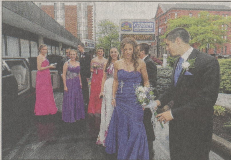
Dallas prom-goers arrive in style in a limousine.