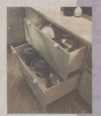
Visit our Showroom . In-home Consultation . Installation Services