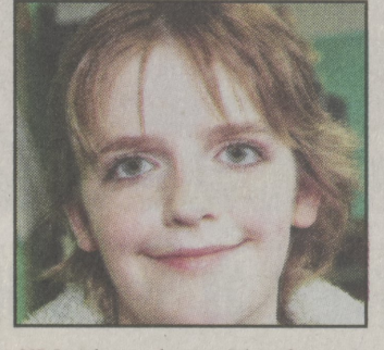
"My teacher. She is strict and a real neat freak. I hope she doesn't get this paper."