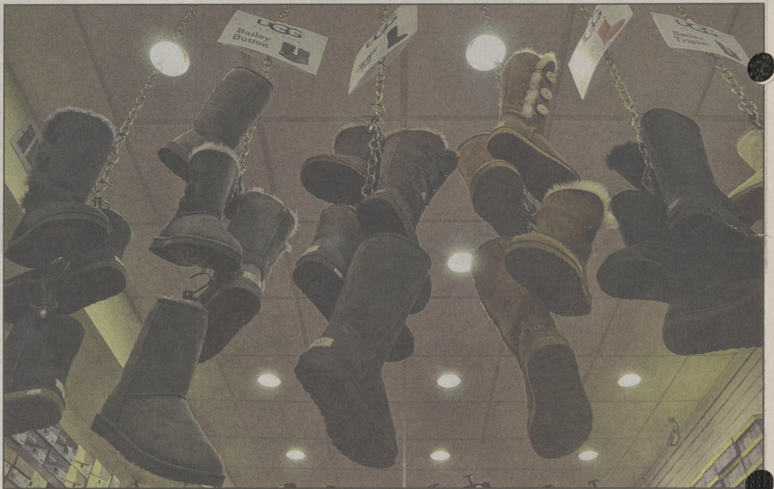
Humphreys' Bootery gets creative with space, hanging a display of Ugg boots from the ceiling.

"We thank the people who stop and think and decide to shop locally," he said.