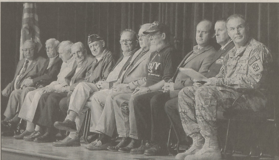
Eleven area veterans and active military participate in a panel discussion at the Veterans' Day Commemoration at Dallas High School.