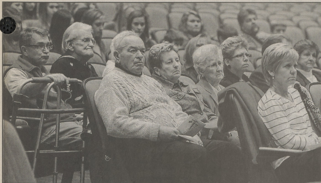
The audience watches the Fourth Annual Student Leadership in Civics Veterans' Day Commemoration at the Dallas High School auditorium.