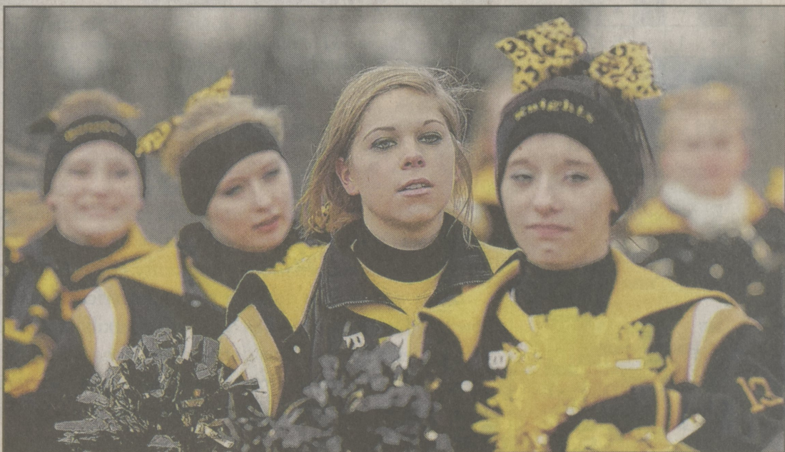
Lake-Lehman cheerleaders root for the Black Knights.