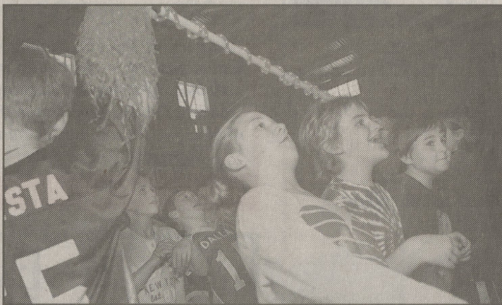
Students at Dallas Elementary School race around the gym to the tunes of a disc jockey as part of a Race for Education that helps raise money for school projects not covered by the school's annual budget.