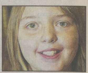
"To honor soldiers that fought in WWI and all the wars."