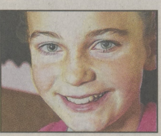
"To honor those that fight for us wherever I the world they are stationed so that we