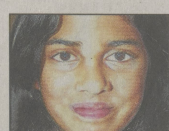
"To honor veterans who fight for us or are in the army. It could be my brother or sister, anybody.