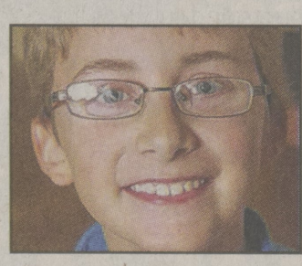
"To let them know we care. We really care that they are risking their lives for us."