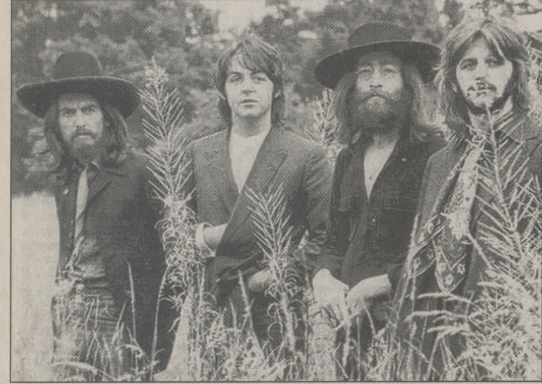
During the month of the 50th anniversary of the release of the Beatles' first single of 'Love Me Do,' the Dietrich Theater in Tunkhannock is hosting a free presentation chronicling the Beatles, a musical phenomenon that changed popular music forever, at 3 p.m. on Sunday, Oct. 21.