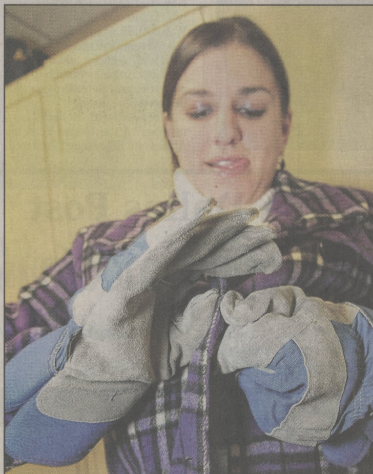
Trying to button your coat with hand disabilities can be troublesome.

I also had the opportunity to travel part of Misericordia's cam-