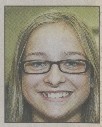
"They say I used to run around in diapers and cowboy boots, yelling 'Yee-Haw, Yee Haw.'"