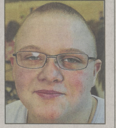
"Probably when I shot myself in the arm with a broken bow and arrow. I didn't know the arrow was broken."