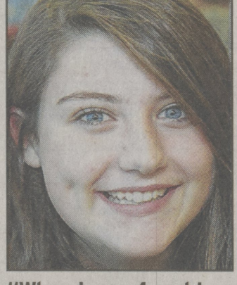
"When I was 4 and I started to scream in church because I liked the acoustics so much."