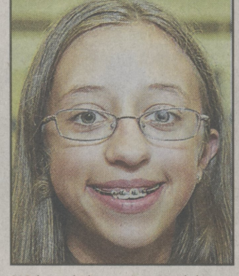
"About how I would line up all the chairs, jump on them and then jump on the Christmas tree."