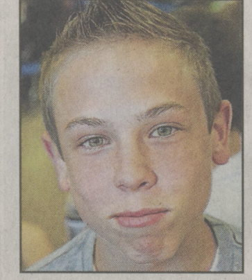
"I would sleep with my arm between the beds and then think dinosaurs were going to eat it at night."