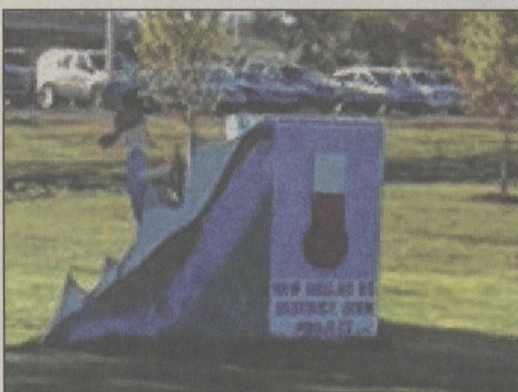
Members of the public will have the option of voting to have the sign moved to the Dallas School District campus.