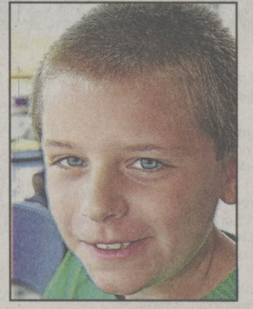
"Fractions. You multiply two numbers together to get an answer."