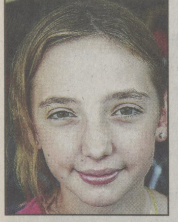
"I learned about the state and U.S. governments and that there are three branches."