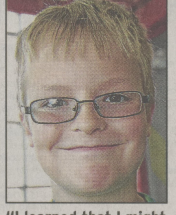
"I learned that I might be able to play the trumpet for our play 'Reindeer Games.'"