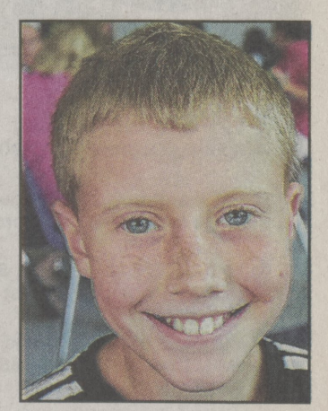
"Sequencing. It's like about putting things in order - first, secon and third."