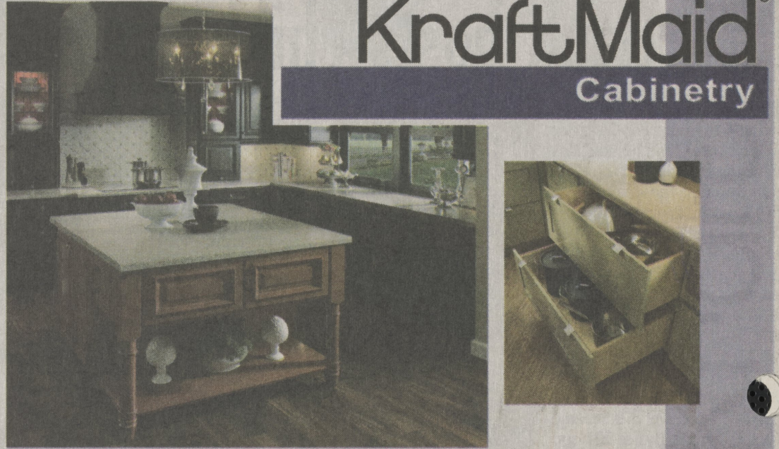
Visit our Showroom . In-home Consultation . Installation Services

17 east center street shavertown, pa 18708 ph 570.675.7083 fax 570.675.7182