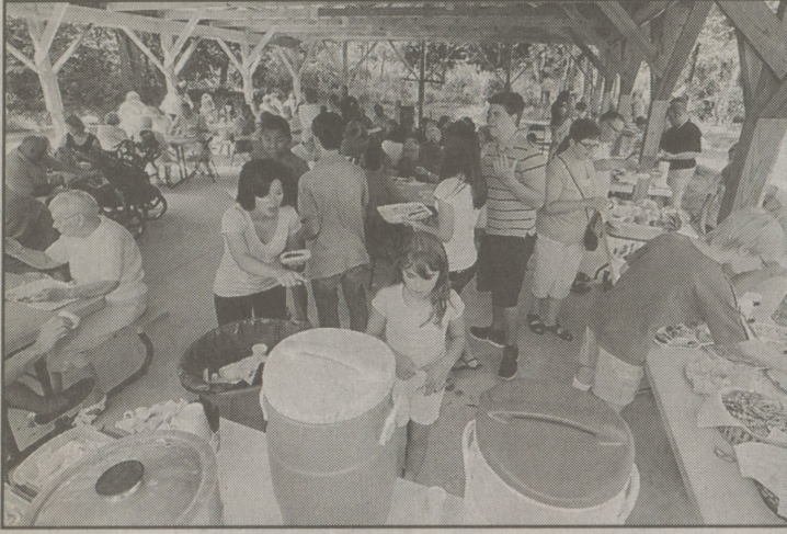
Dozens of people pack the pavilion at the Shavertown United Methodist Church for the picnic lunch.