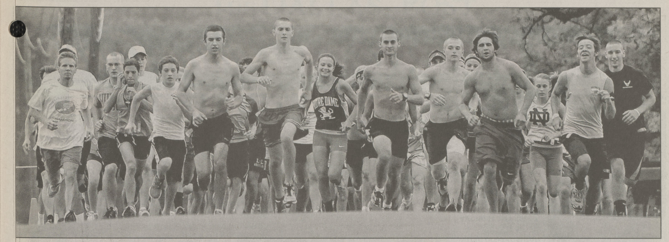
Runners take off to start the Run for the Fallen at Penn State/Wilkes-Barre in Lehman Township.