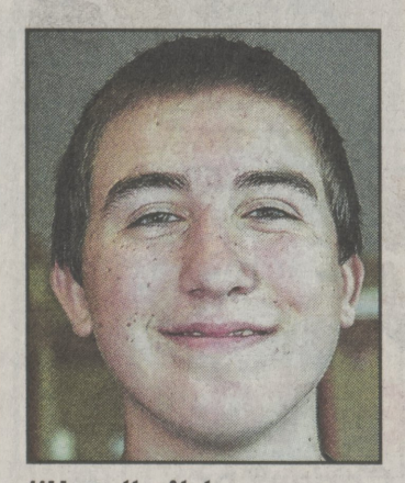
"Usually it happens when I'm walking around at the Luzerne County Fair. It's very awkward."