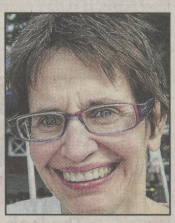
"Not to my knowledge, though I have done it to others many times."