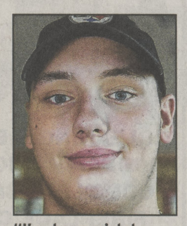
"I've been mistaken for my dad. It's sort of embarrassing because he's so much older."