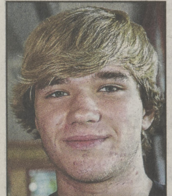
"Yes. It was really weird and awkward. I didn't know who the person was anyway."